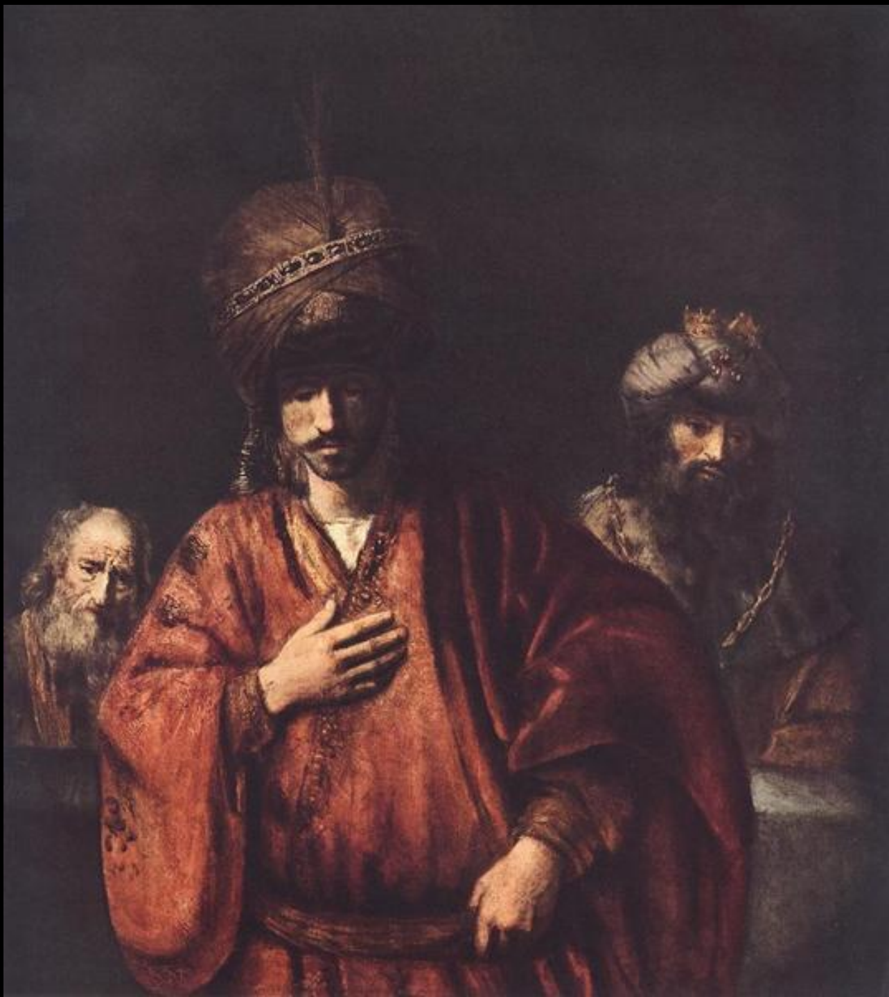
Uriah the Hittite