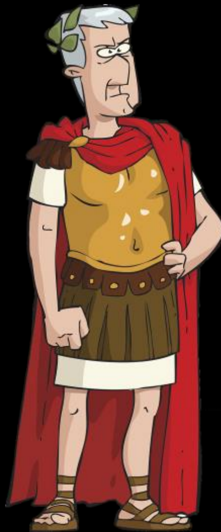
Alexander The Great!