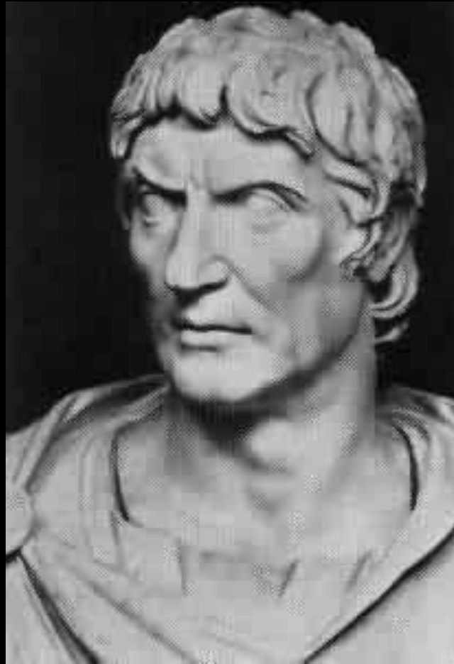
Antiochus IV Epiphanes