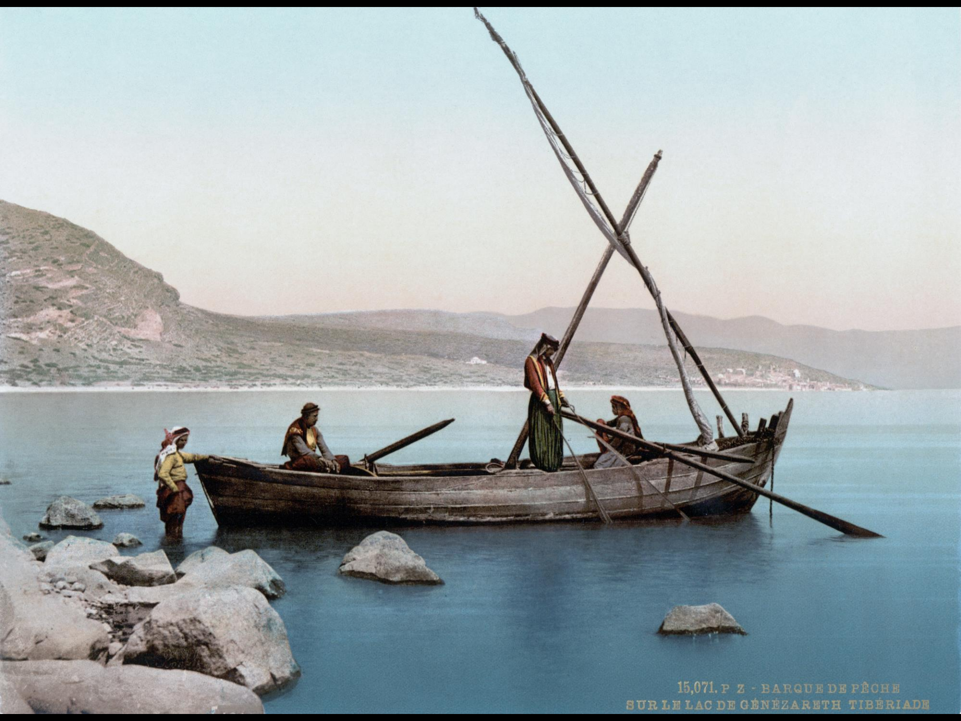
15,071. P Z - BARQUE DE PÊCHE SUR LE LAC DE GÉNÉZARETH TIBÉRIADE