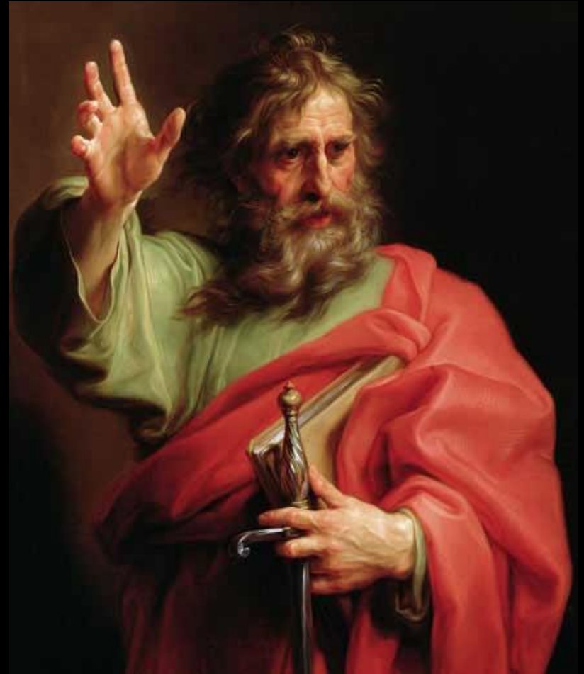
The Apostle Paul

“Even though I was once a blasphemer and a persecutor and a violent man, I was shown mercy because I acted in ignorance and unbelief. The grace of our Lord was poured out on me abundantly, along with the faith and love that are in Christ Jesus. ” 1 Tim. 1