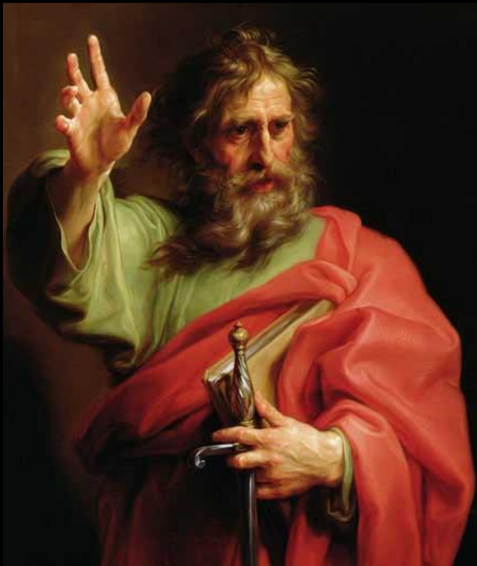
The apostle Paul