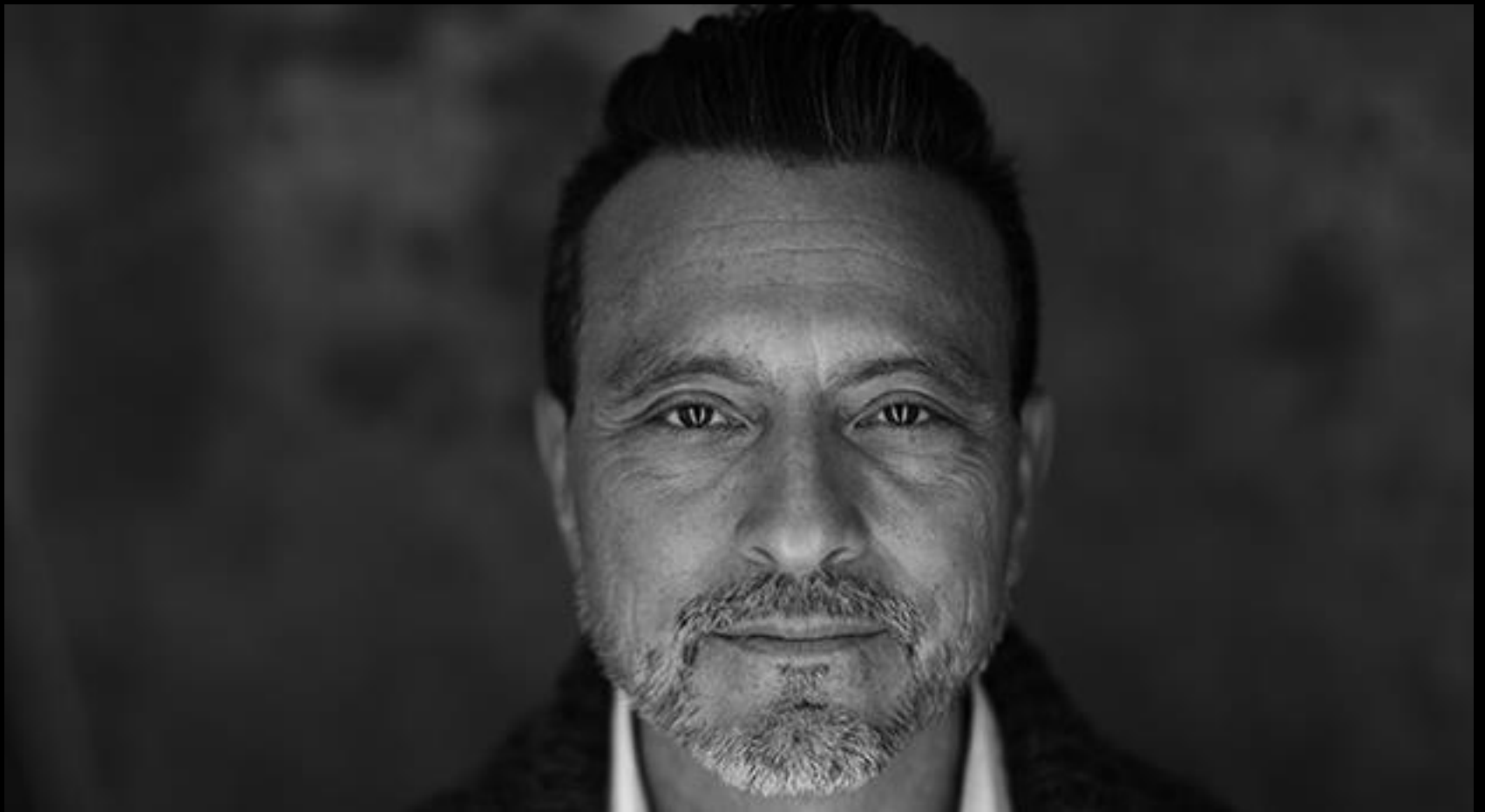
Erwin Raphael McManus